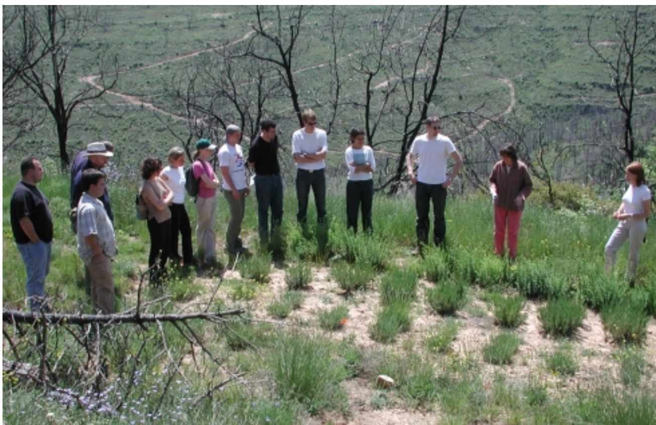
Excursion to Solsones burn site as part of the POC.