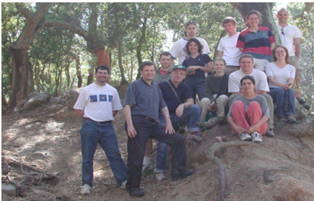
MSc EF students and lecturers in cork oak plantation in Catalonia, Spain.

The other students have spent their Applied periods with various organisations from Consultants; FEG oy Joensuu Finland, to research at the European Forestry Institute.